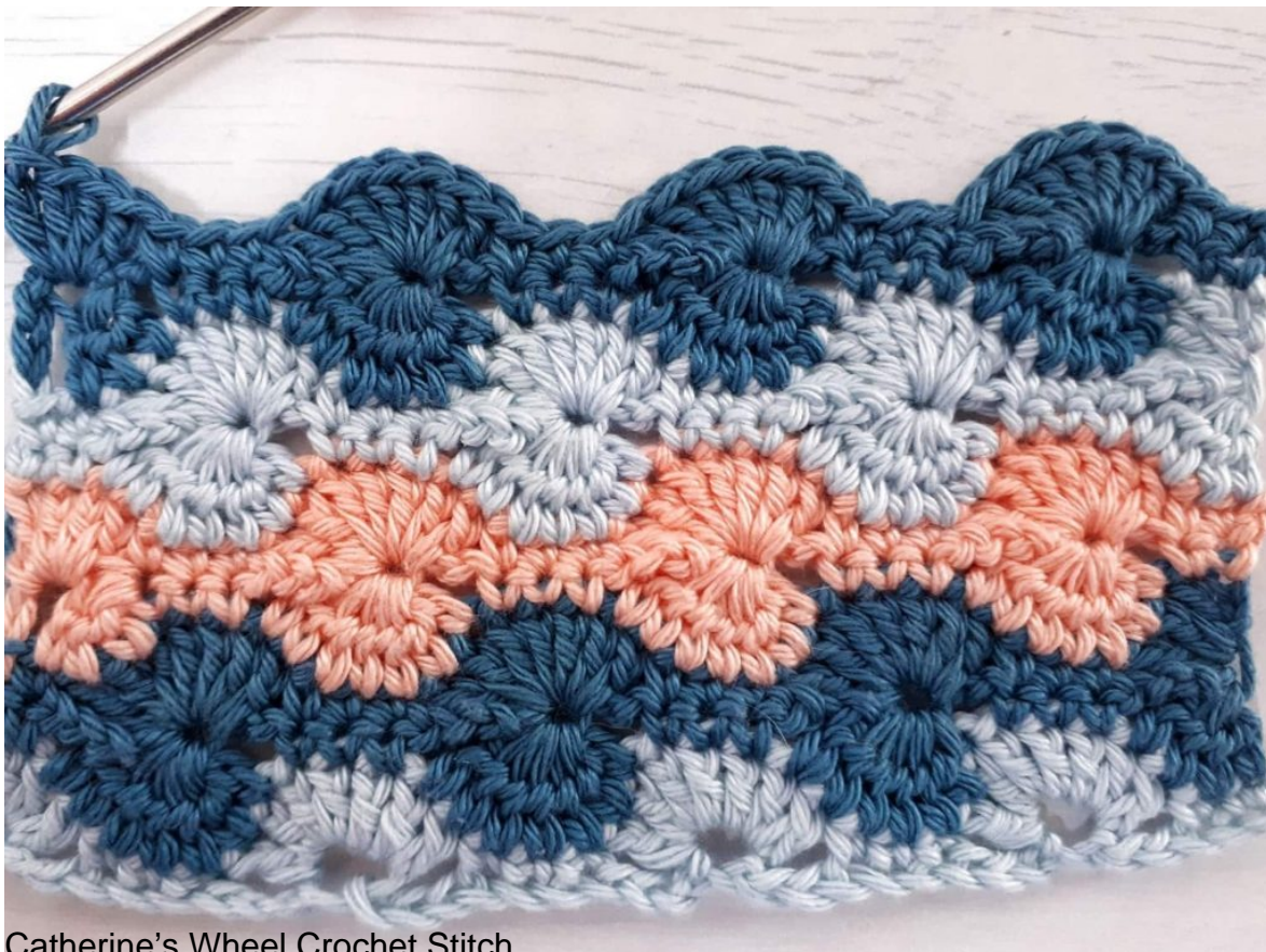
Catherine's Wheel Crochet Stitch

The beauty of handmade blankets is that they can be customized to match your personal style and preferences. Whether you opt for a bold and vibrant color scheme or a more subtle and neutral palette, the Catherine's Wheel Blanket becomes a reflection of your unique creativity.