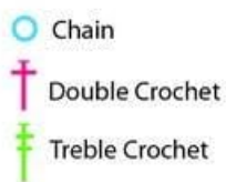
sunburst granny square Diagram